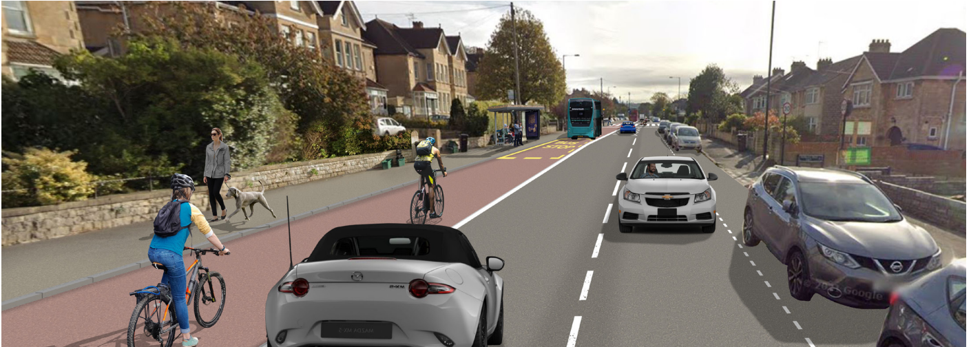
A new bus lane is proposed on Newbridge Road on the way into Bath.

We're asking for your views and comments at a very early stage before we progress any further. Nothing is decided at this stage. The detail still needs to be assessed and is not fixed yet, we'd like your feedback on the overall ideas, rather than the details - what you like, what you don't like, and why. Your feedback will shape what happens next.